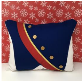
Style A (front)