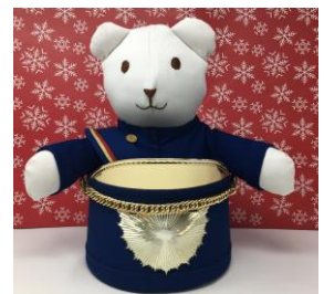
Bear in Shako