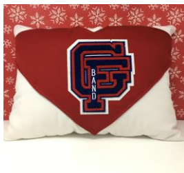
Style B (front)