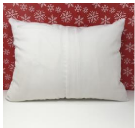
Style B (back with functional pocket)