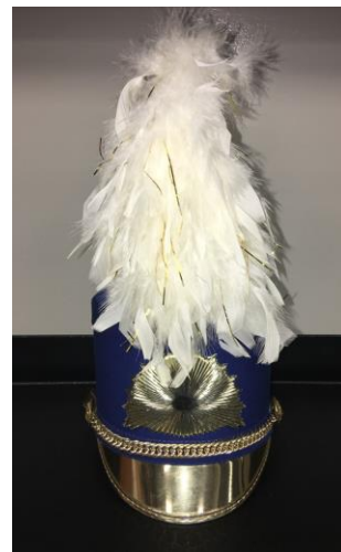
Hat with Plume