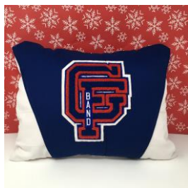
Style A (back)